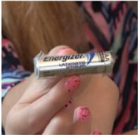
+1 Primary Lithium Batteries