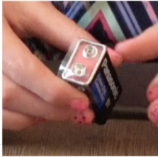
Tapesters #2 9 Volt Batteries