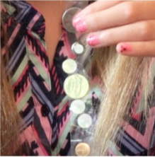
Tapesters #1 Button Cell Batteries

As a precautionary measure to reduce the risk of short circuit, please ensure you tape the terminals on all the Tapesters while storing your batteries at home and before recycling your batteries at school.