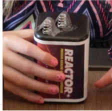
Tapesters #3 6 Volt Batteries