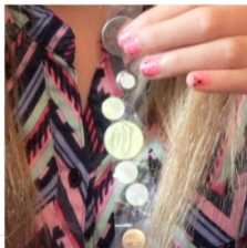
Tapesters #1 Button Cell Batteries

As a precautionary measure to reduce the risk of short circuit, please ensure you tape the terminals on all the Tapesters while storing your batteries at home and before recycling your batteries at school.