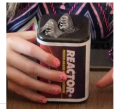
Tapesters #3 6 Volt Batteries