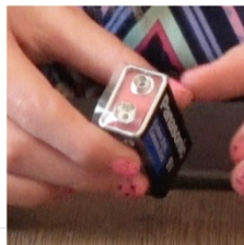
Tapesters #2 9 Volt Batteries