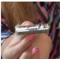
+1 Primary Lithium Batteries