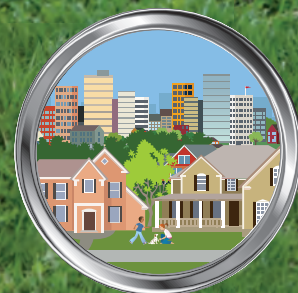
Curbside & Municipal Programs

Raw Materials Company Inc. 1.888.937.3382 sales@rawmaterials.com www.rawmaterials.com