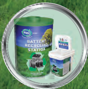
Retail and ICI Programs